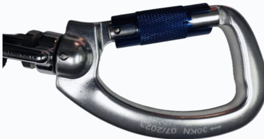
Auto-lock swivel carabiner