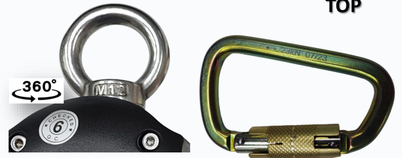
Eye swivel top + auto-lock carabiner attachment