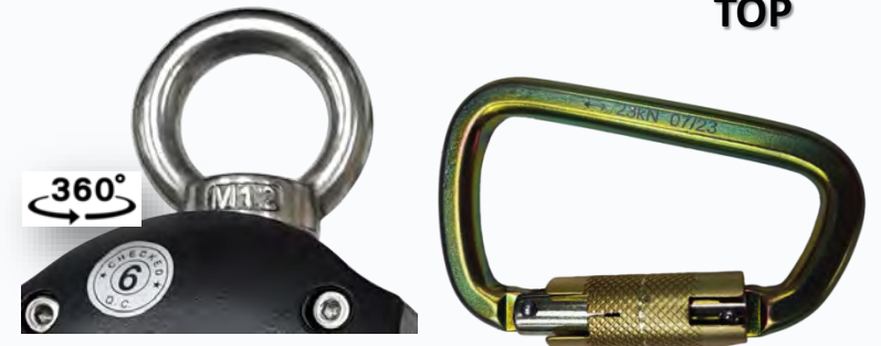
Eye swivel top + auto-lock carabiner attachment