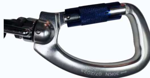
Auto-lock swivel carabiner