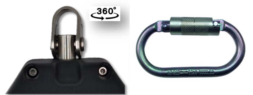
Swivel top + auto-lock carabiner attachment