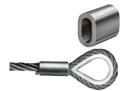
T ferrule (T) (aluminium)

Please note that these instructions are only applicable to products produced and supplied by Talurit AB, Sweden and Gerro GmbH, Germany!