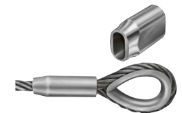
TKonit (TK) (aluminium)