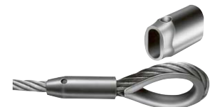
TKonit H (TKH) (aluminium)

f = Fill factor, is the ratio between the sum of the nominal metallic cross-sectional areas of all the wires in the rope and the circumscribed area of the rope based on its nominal diameter.